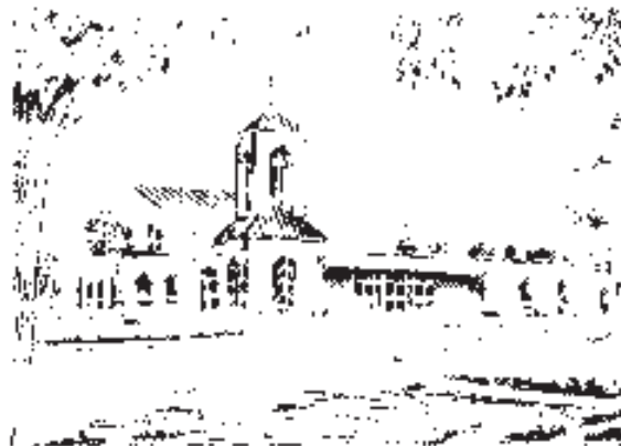
Our Lady of the Lake 129 Metro Road North, Keswick, ON L4P 3C8 Telephone: 905-476-0097 Fax: 905-476-0897